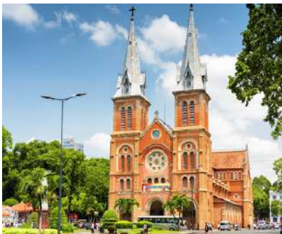
Cathedral of Notre Dame

Distance Tan Son Nhat Airport – Saigon Central: 7 – 8km → 30 minute transfer