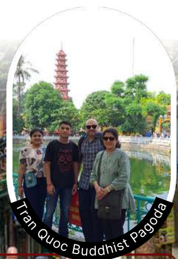
Tran Quoc Buddhist Pagoda