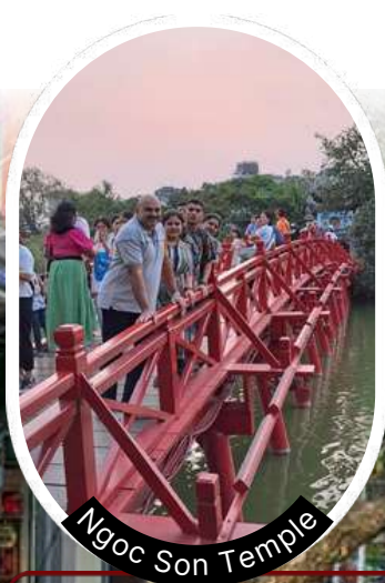
Ngoc Son Temple

Flight: Saigon - Hanoi: (suggested flight before 11:00, airfare excluded on our price)