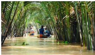
Thoi Son Island

Distance Saigon Central - My Tho: 75km -> 2 hour transfer