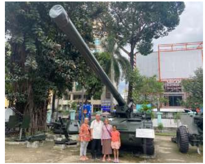
War Remnants Museum