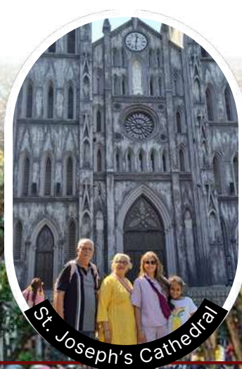
St. Joseph's Cathedral